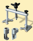
Alu Puller ref. 050921