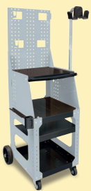
Spot 1600 trolley ref. 051348