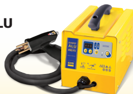
GYS SPOT ALU PRO FV ref. 021990