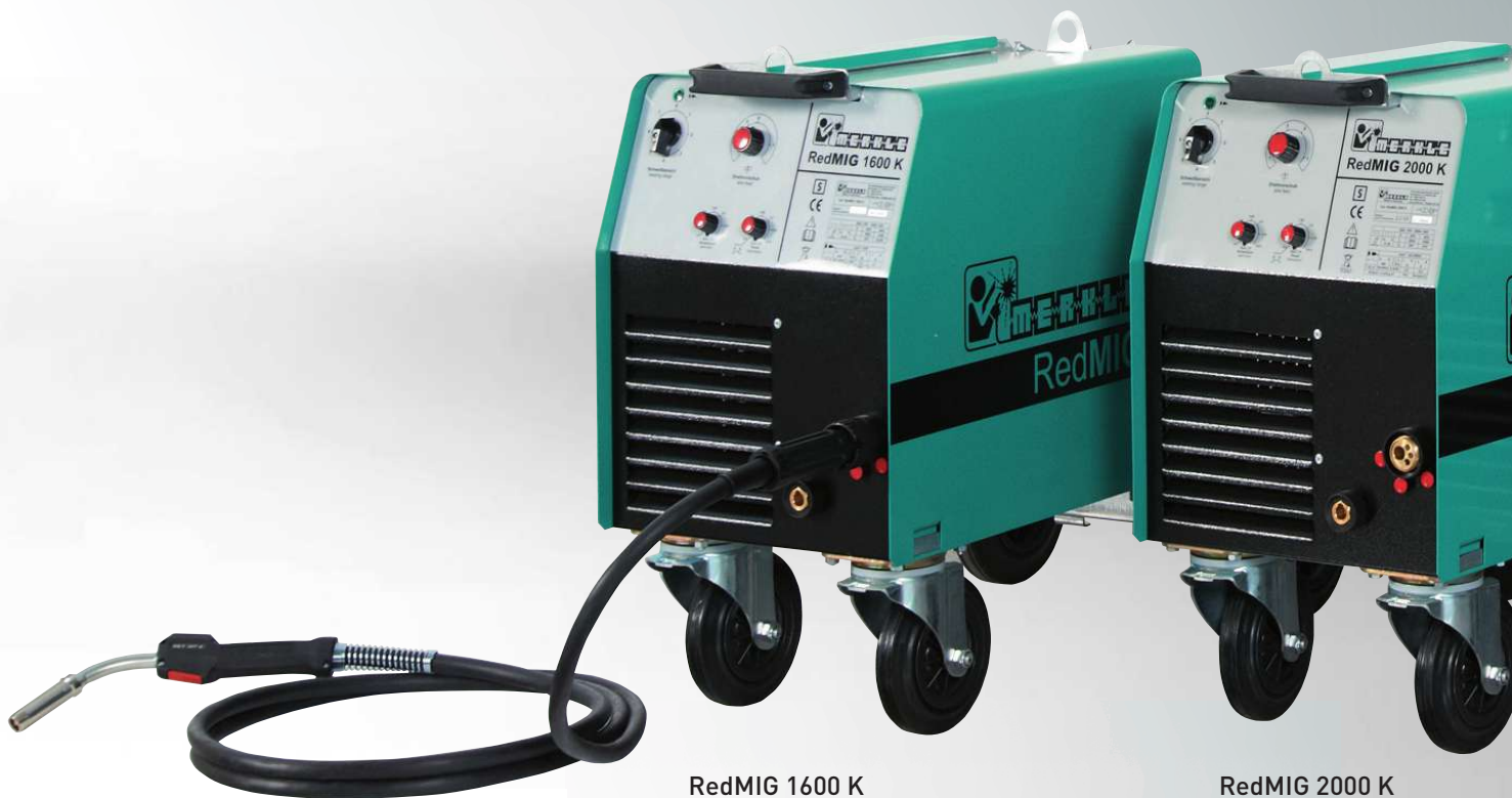
RedMIG 1600 K