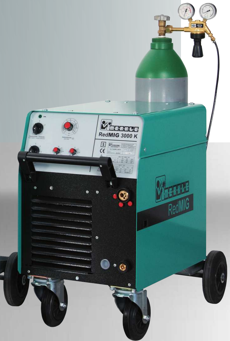
RedMIG 3000 K