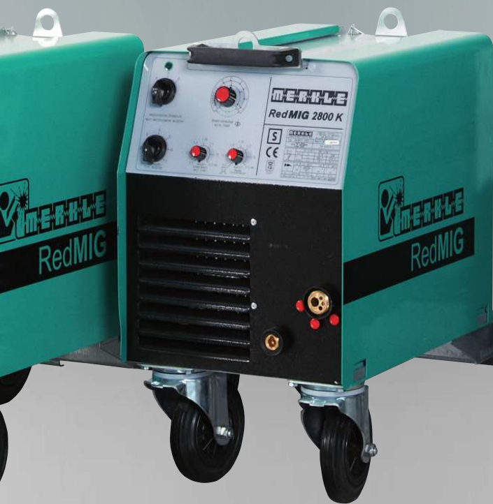
RedMIG 2800 K