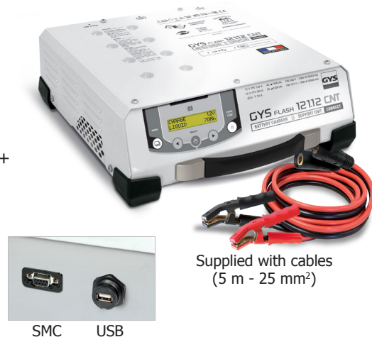
Supplied with cables (5 m - 25 mm 2 )