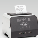
SPM: Printer module 026919