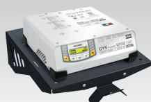
Wall shelf 055513