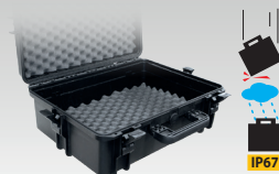
Carry case 060432